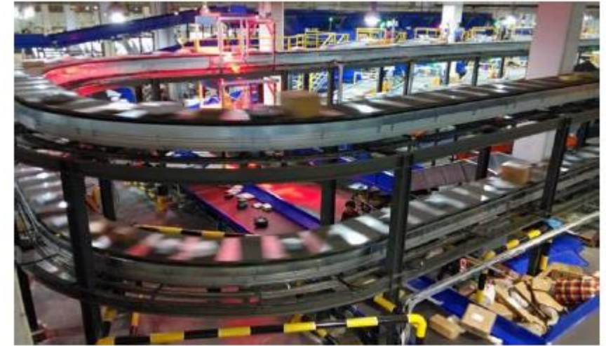
For illustration purpose only